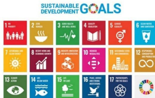
Figure 1: Sustainable Development Goals (SDGs)

reinforced by worldwide leaders in a consensual way. This indicated the beginning of a new universal elaboration program starting from January 1, 2016, aimed at attaining seventeen sustainable development goals for the year 2030 (refer to figure 1). [1].